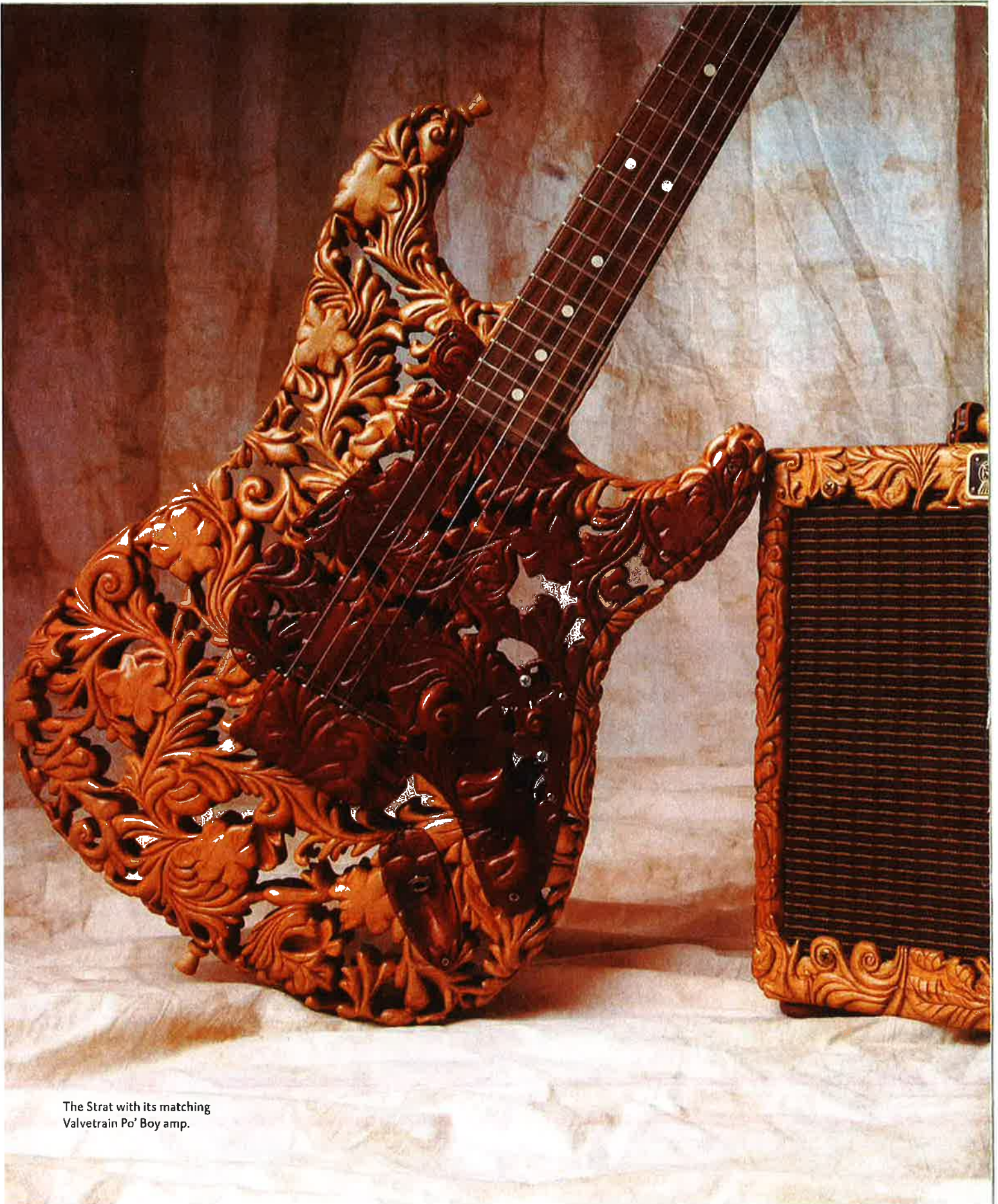
The Strat with its matching Valvetrain Po' Boy amp.